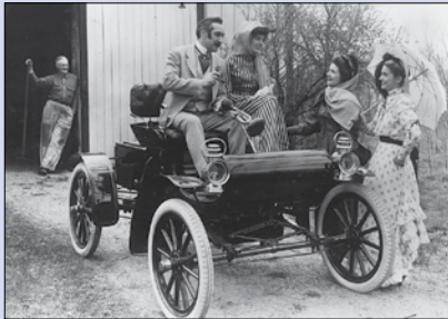
1901 Curved Dash Oldsmobile

A special display of pre-1915 automobiles