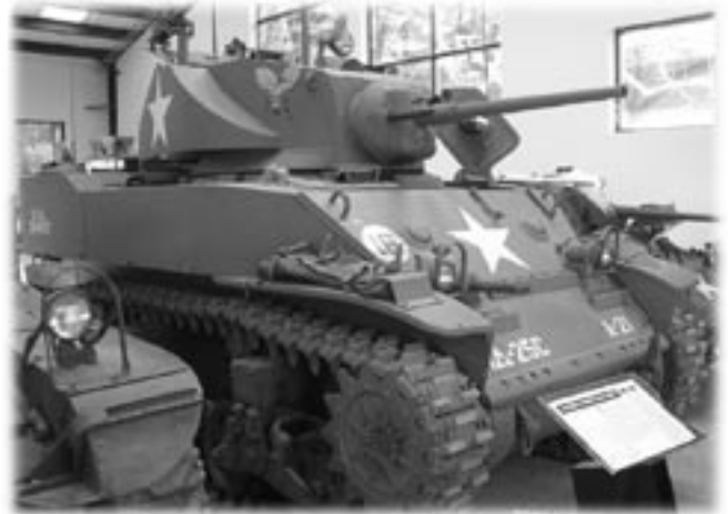
Stuart Light Tank

Once again Masters Grove will be staffed with more than twenty-five examples of vintage WWII military vehicles ready for your inspection. Most of us have never seen a tank up close, or a half track, or a "deuce-and-a-half", and certainly never climbed on one - but now's your chance! Tanks, trucks, jeeps, all sorts of rolling stock you've only seen in movies will be ready for your review, and the proud owners will be there to tell the tales about their vehicles.