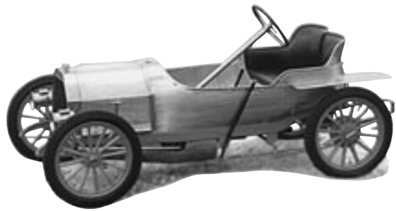
1909 Bugatti "Petit Pur-Sang" Type 10