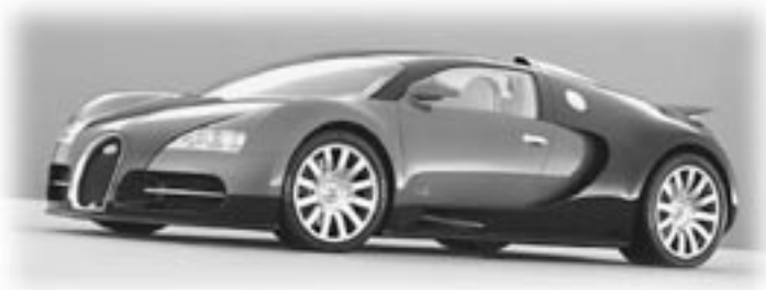
Bugatti Veyron 16-4