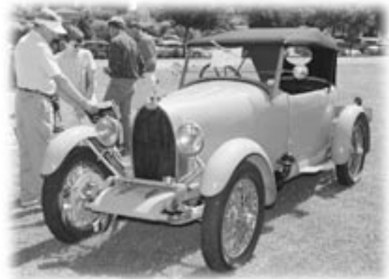
1926 Bugatti Type 38 Torpedo owned by Sid Colberg