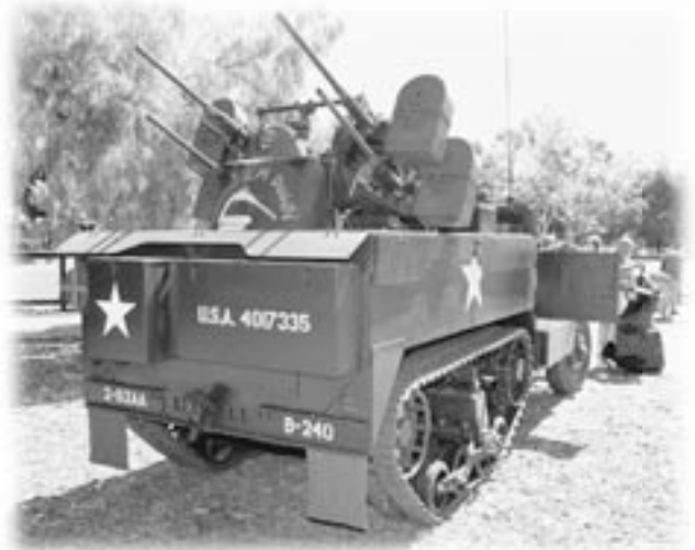
M16 Half Track

The United States, during the war years, built over 3 million transport vehicles, 88,410 tanks, 44,170 half-tracks, 82,000 tractors, and several thousand specialist vehicles. Names like "Duck", "Jimmy", "Seep", and others became part of the everyday vocabulary. Most have faded into the past or were converted into alternative uses. Some survived. "One man's junk is another man's treasure" was surely the case when it came to restoring the type of vehicle in this exhibit.