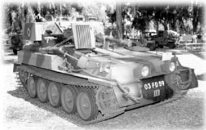
British Scorpion Reconnaissance Vehicle