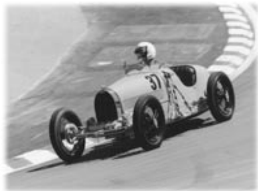
1926 Type 39A Grand Prix Racer owned by Charles Shavoy