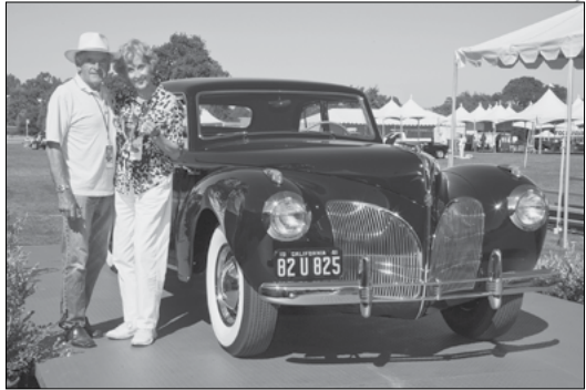
2011 Best in Show Chris & Elenore Bang , San Jose, CA 1941 Lincoln Continental

If your car won a 1st, 2nd or 3rd Class trophy or one of the special awards at the Palo Alto Concours, have we got a deal for you. Our Concours photographer may have taken a terrific picture of you and your car on the ramp and we've decided to offer them to you. If you won a special trophy, now you can have the picture to go with it. All you need to do is make a donation of $25.00 to the Concours and we'll take care of the details. Send your check to: Palo Alto Concours, 800 San Antonio Road, Suite 6, Palo Alto, CA 94303. Questions? Call (650) 813-1100. ◀